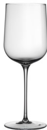
WHITE WINE cut / crystal 3.3 × 9.1 in / 14.86 oz 30402