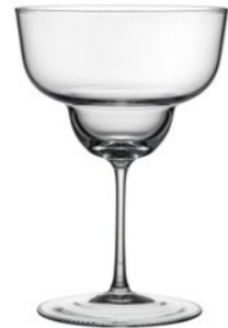
MARGARITA cut / crystal 4.3 x 6.3 in / 10.81 oz 30409/s