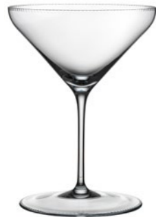
MARTINI cut / crystal 4.6 x 6.3 in / 7.43 oz 30409/c

These elegant glasses of pure crystal with a gentle pearl cut are ideal for serving cocktails. Each stands out as a small piece of artwork. In Decent glasses, your cocktails will provide not only refreshment but also a stylised experience for all the senses.