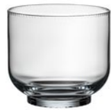
WATER, WHISKY cut / crystal 3.1×3.3 in / 10.81 oz 30408/O

Made of thin-walled crystal with a delicate pearl cut, the glasses from the Decent Collection transform every sip into a small experience – whether you opt for an elegant distillate, golden beer, or simply water, each will taste just shy of magical. The carafe and bottle complete the full concept and naturally interlock the individual elements, bringing harmony and balance to every detail on your dining table.