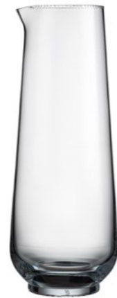
CARAFE cut / crystal 3.6×9.4 in / 27.03 oz 30400/KAR