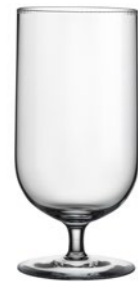
WATER, BEER cut / crystal 2.9×5.9 in / 13.51 oz 30416