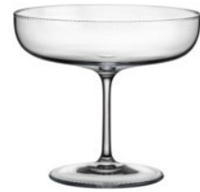
CHAMPAIGNE cut / crystal 4.6×4.2 in / 6.76 oz 30409

The thin-walled glasses of the purest crystal, adorned with a subtle pearl cut, enchant at first glance and touch. Their shape reveals a stunning dance of bubbles, allowing the champagne to stand out in all its beauty. They were created for festive moments – on a table full of flowers, at celebrations, and during wedding toasts, radiating with one-of-a-kind elegance.