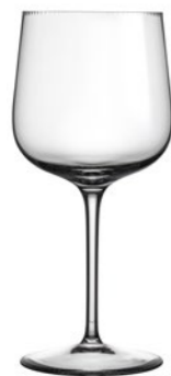
RED WINE cut / crystal 3.4 × 7.3 in / 11.82 oz 30402