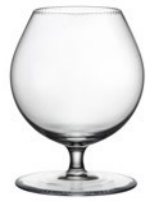
BRANDY cut / crystal 3.1 × 4.1 in / 8.78 oz 4669 / III / 30400

The Decent glasses are an excellent choice for noble distillates and liqueurs. They underscore their unique character, highlighting the beverages' colour, sparkle, and rich aroma. Thus, an unforgettable experience will accompany every tasting.