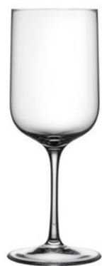
WHITE WINE cut / crystal 3 × 7.9 in / 9.12 oz 30403

The Decent glasses, made of pure lead-free crystal with a delicate pearl cut, come to life thanks to the glassmakers' honest handiwork, resembling the efforts of winegrowers in their passion and respect for the trade. The glasses' exquisite design underscores the colour, aroma, and flavour of the wine. Craftsmanship, the senses, and the magical moment when wine is enjoyed to the fullest all unite as one in these glasses.