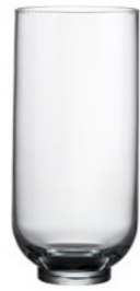
HIGHBALL cut / crystal 2.7×5.7 in / 14.19 oz 30418/I