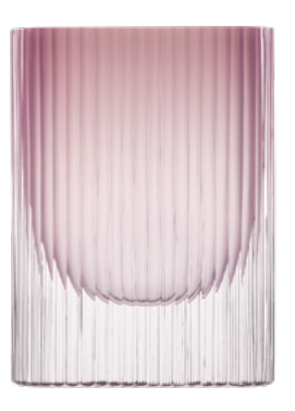
opal rose polished cut 19.5 × 27 cm 7.7 × 10.6 in 03489