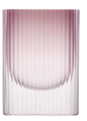
opal rose matt cut 19.5 × 27 cm 7.7 × 10.6 in 03489