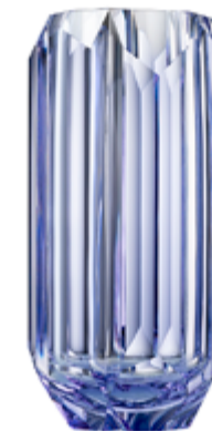
alexandrite crystal layering 16,5 × 33 cm 03506