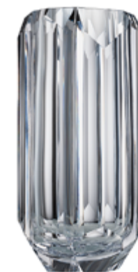
clear 16,5 × 33 cm 03506