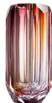
aurora, amethyst, rose tri-coloured core 16,5 × 33 cm 03506