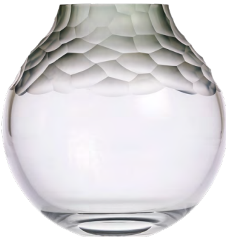
vase smoke green cut pebbles 12,2 × 25 cm / 4.8 × 9.8 in 3498