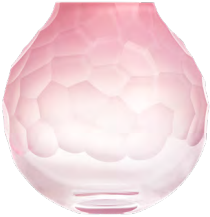
vase opal rose cut pebbles 7,3 × 15 cm / 2.9 × 5.9 in 3498