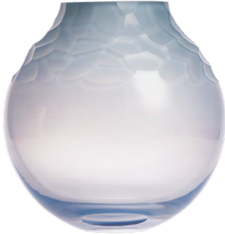
vase opal violet cut pebbles 12,2 × 25 cm / 4.8 × 9.8 in 3498