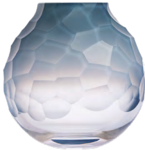
vase opal violet cut pebbles 7,3 × 15 cm / 2.9 × 5.9 in 3498