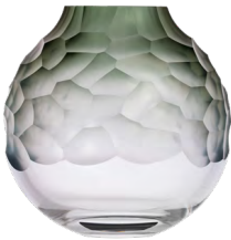
vase smoke green cut pebbles 7,3 × 15 cm / 2.9 × 5.9 in 3498