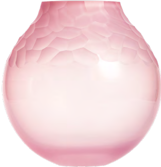
vase opal rose cut pebbles 12,2 × 25 cm / 4.8 × 9.8 in 3498